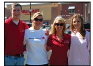
PlainsCapital Bank employees out in the community living united

On June 18 th , individuals and organizations joined together for LIVE UNITED- Pass it On.