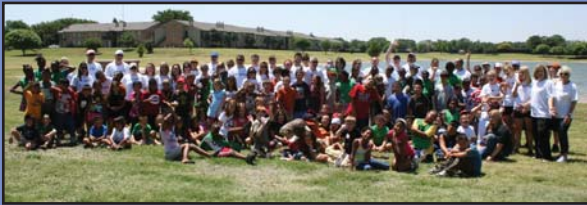
LE's and the kids pose for a group shot at the end of the day

Thank you to everyone involved in LIVE UNITED-Pass it On. See more about it on our home page, www.liveunitedlubbock.org