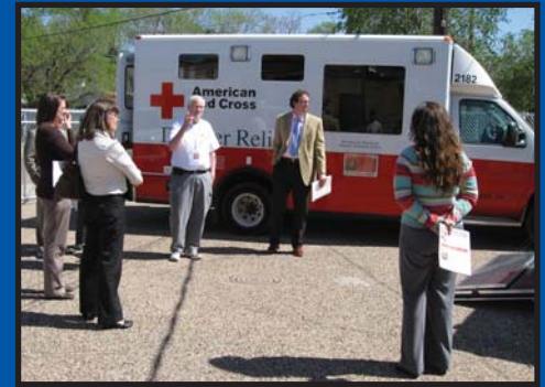
Program Review volunteers listen during a tour at the American Red Cross